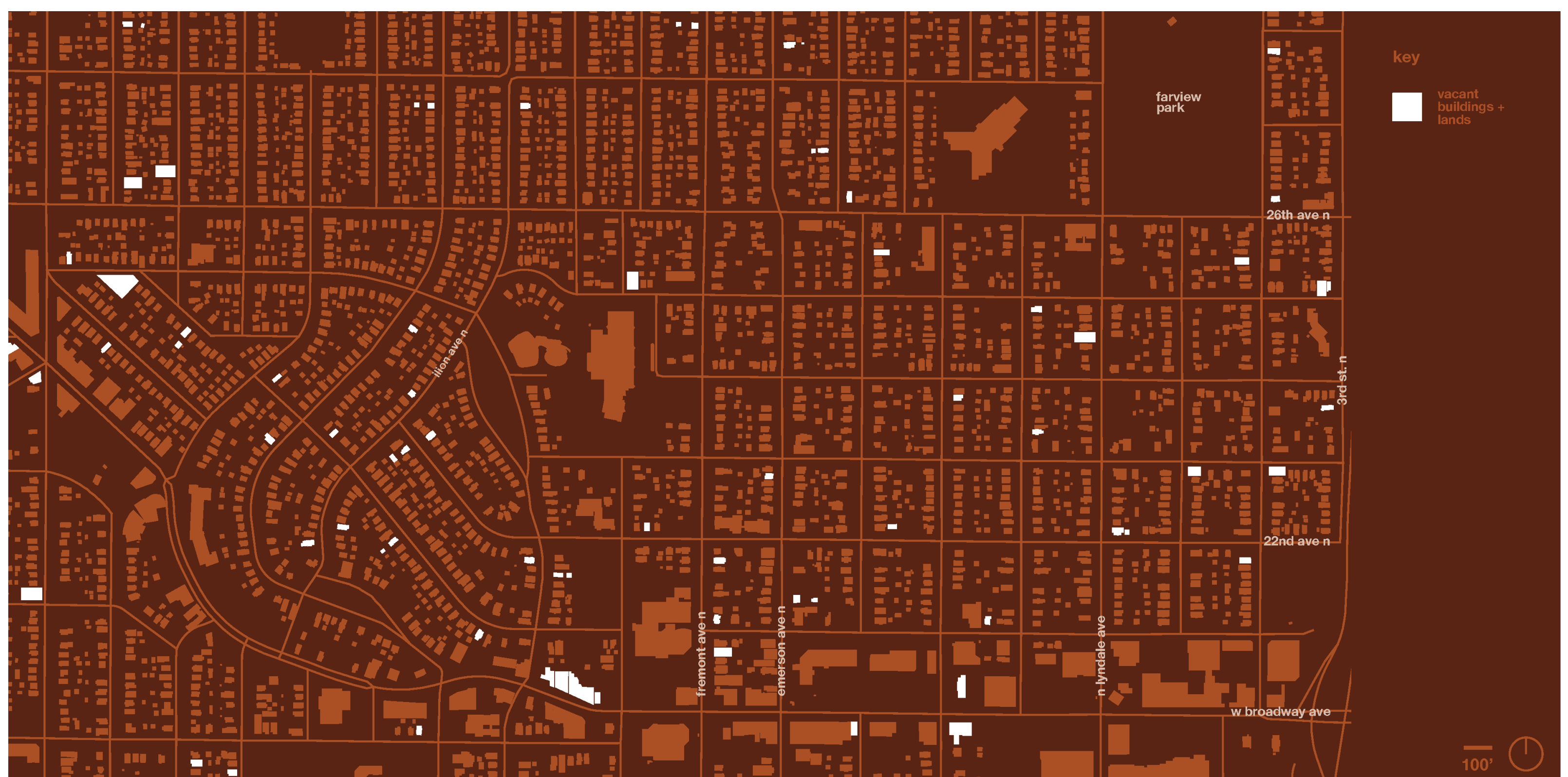
DISTRICT + SITE PLAN SHOWING THE VENUES WITHIN THE CONTEXT OF NORTH MINNEAPOLIS