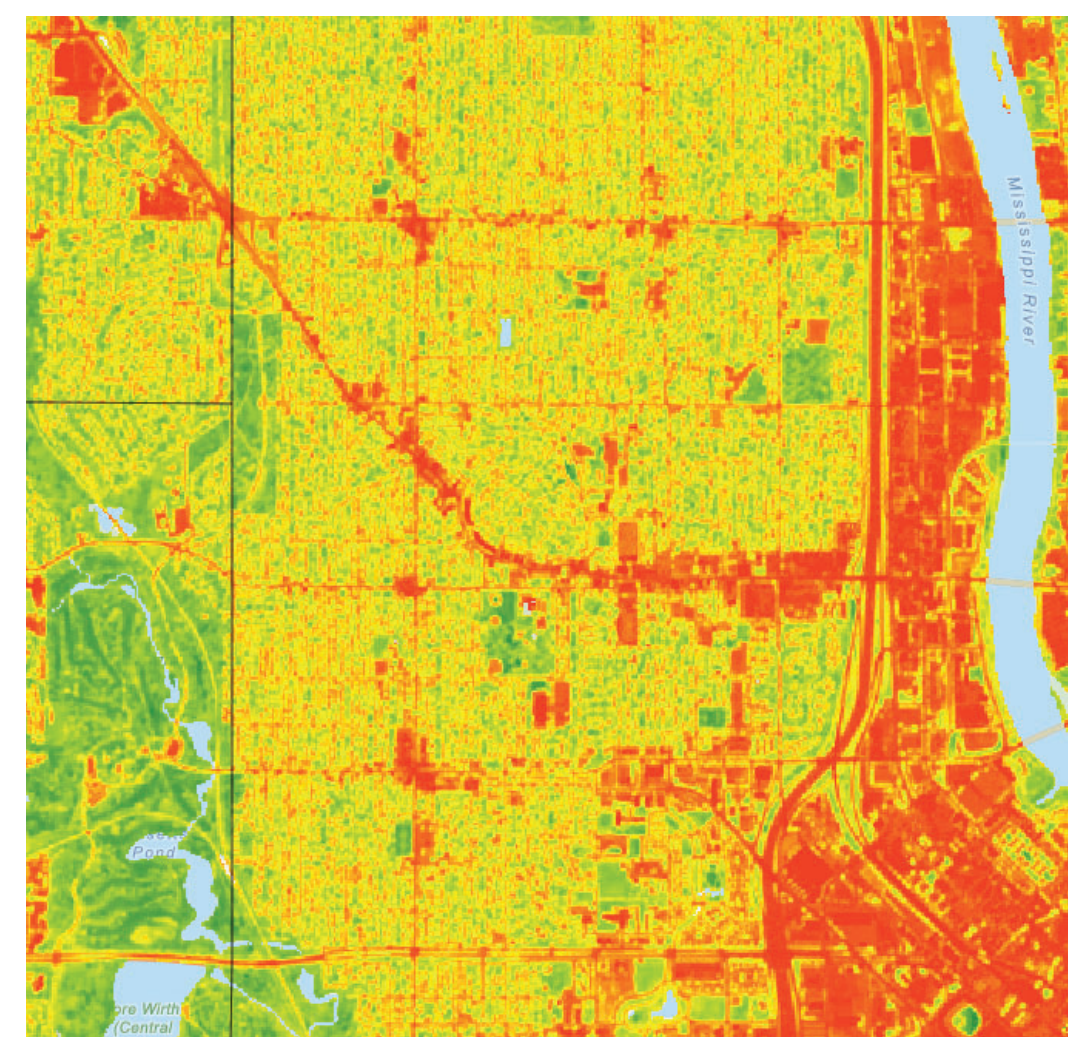
MAP OF NORTH MINNEAPOLIS GROUND TEMPERATURES (2022)