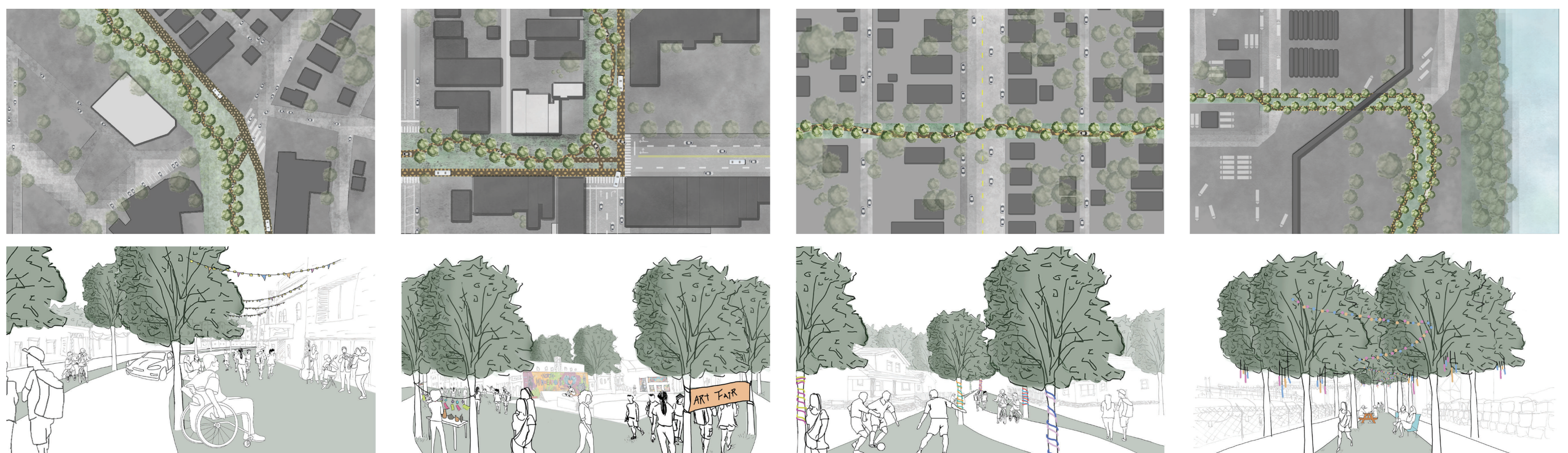
CAPRI THEATHER, JUXTAPOSITION ARTS, N 26TH AVE, AND THE RIVERSIDE