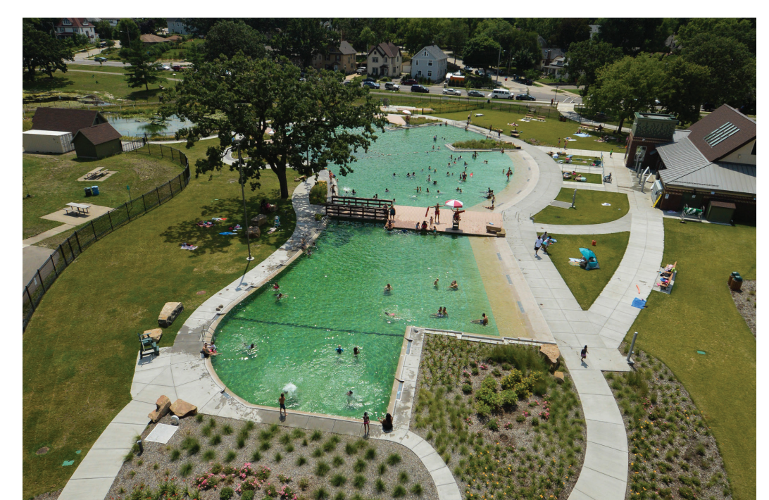
WEBBER PARK NATURAL POOL PHOTO

North Minneapolis Bicycle Advocacy Council advances bicycle transportation in North Minneapolis by building safe trails and connections to other areas of the city.