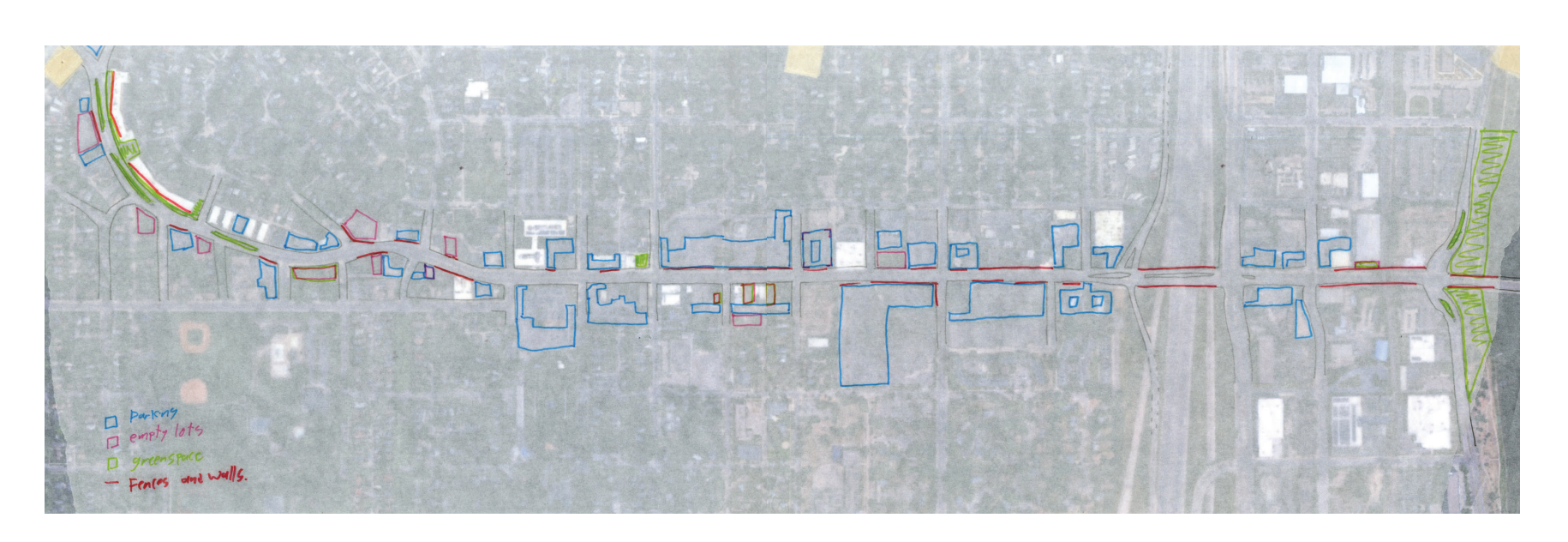
NEIGHBORHOOD CONNECTIONS + BARRIERS DIAGRAM