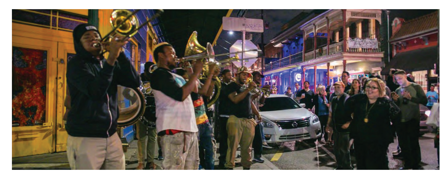
NEW ORLEANS STREET MUSIC