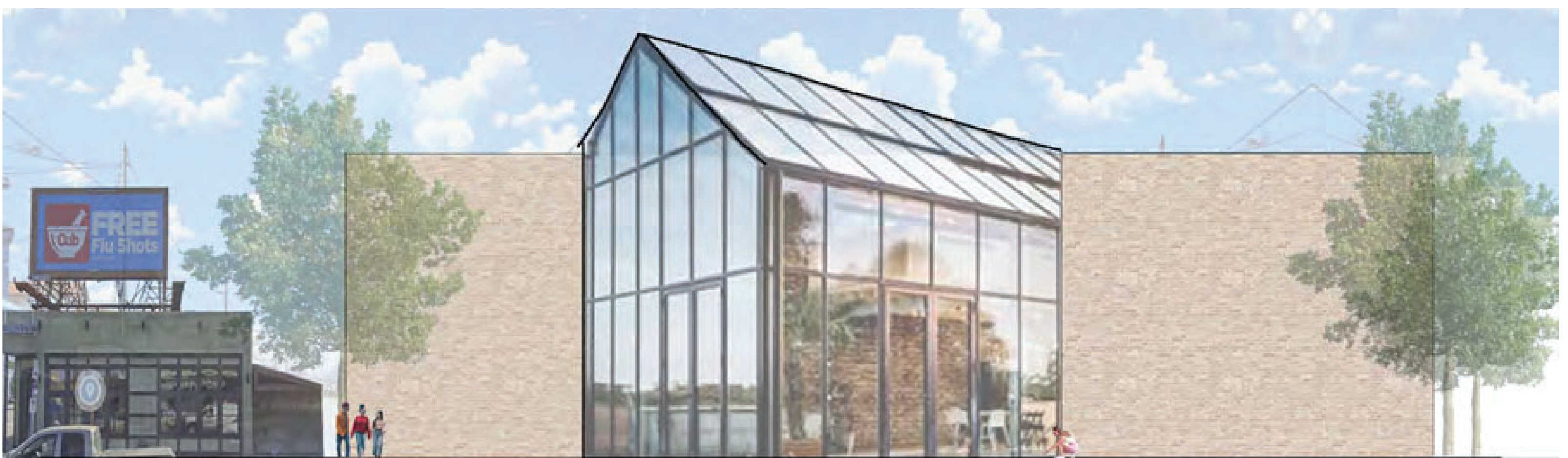
WELCOME CENTER SOUTH ELEVATION