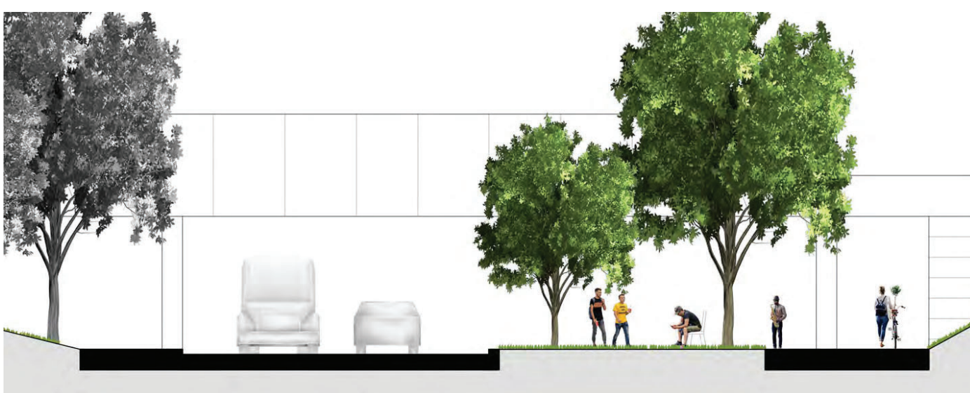
PROPOSED WEST BROADWAY