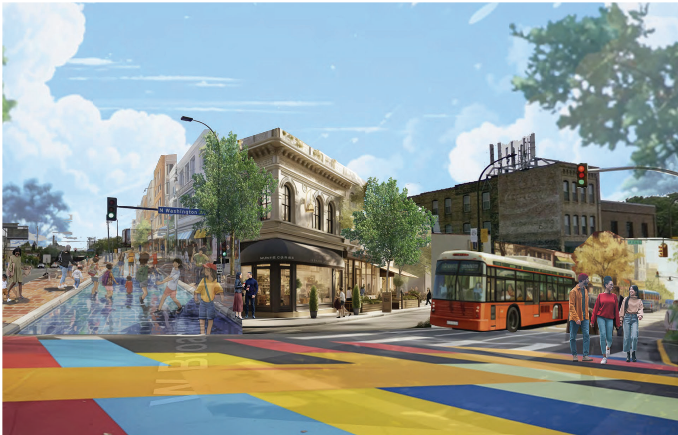
WASHINGTON STREET ENTRY RENDERING