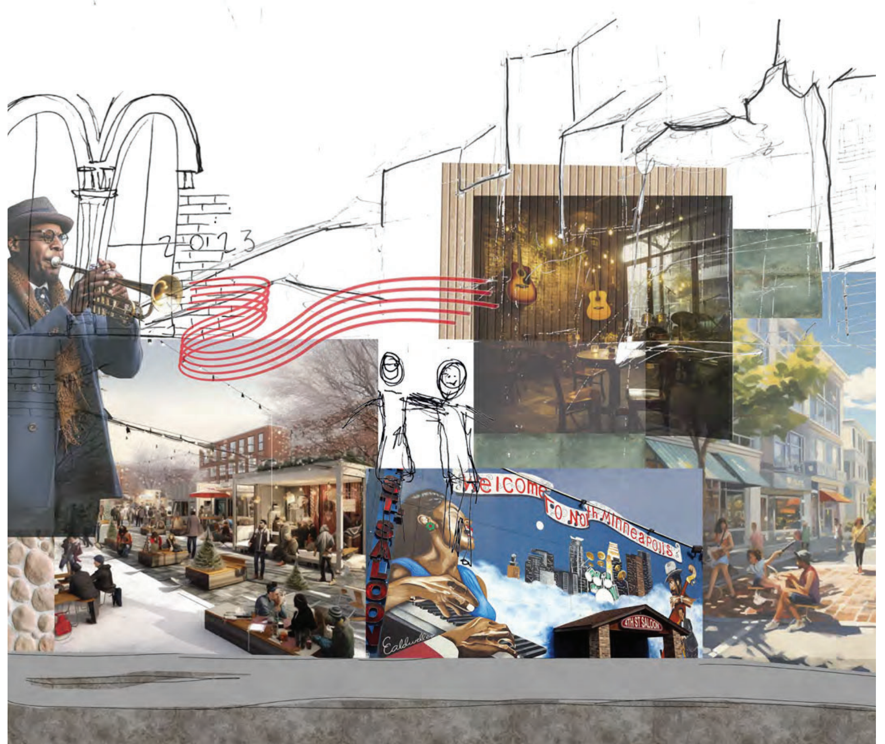
INSPIRATIONAL WEST BROADWAY COLLAGE