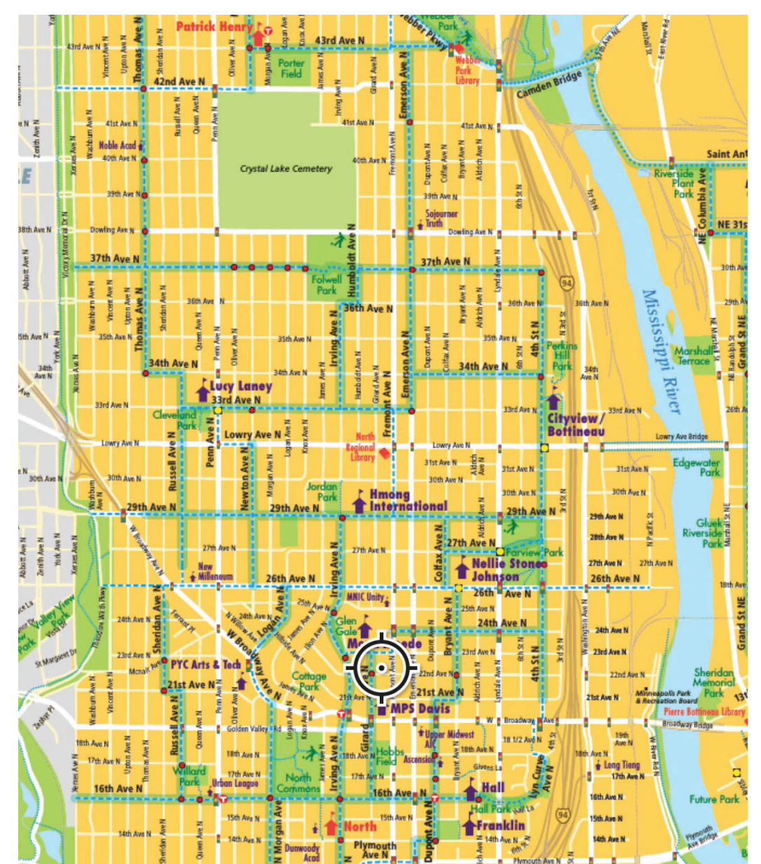
NORTH MINNEAPOLIS YOUTH WALKING ROUTES