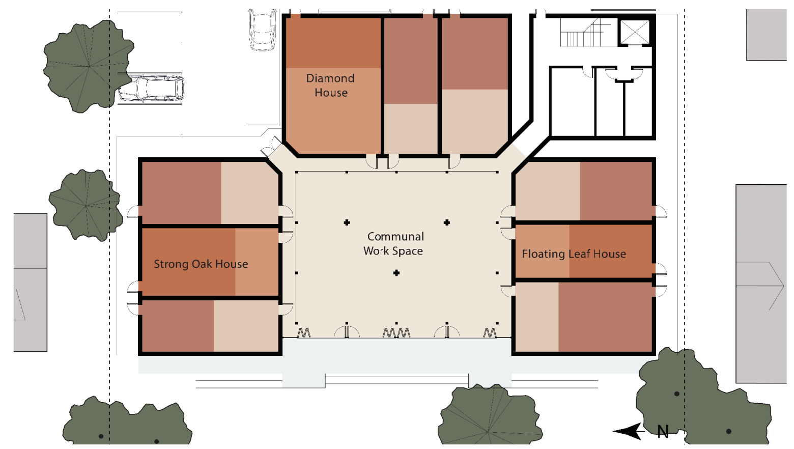
ORGANIZATION OF SHARED WORK + LIVE SPACES