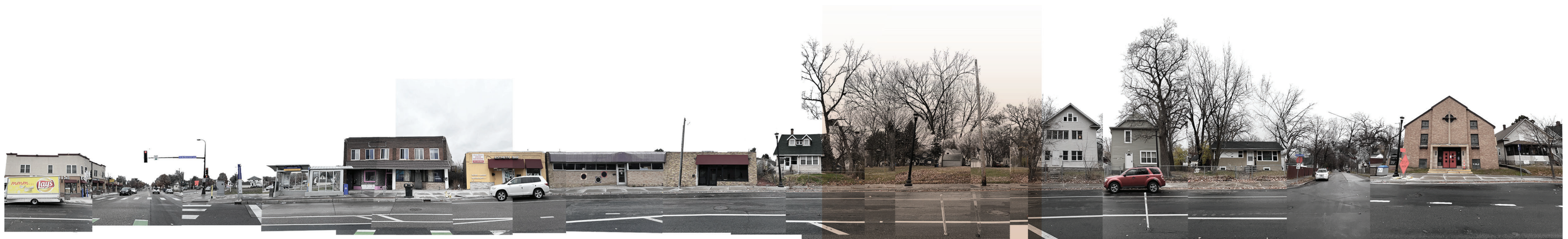
EXISTING STREET CONDITIONS