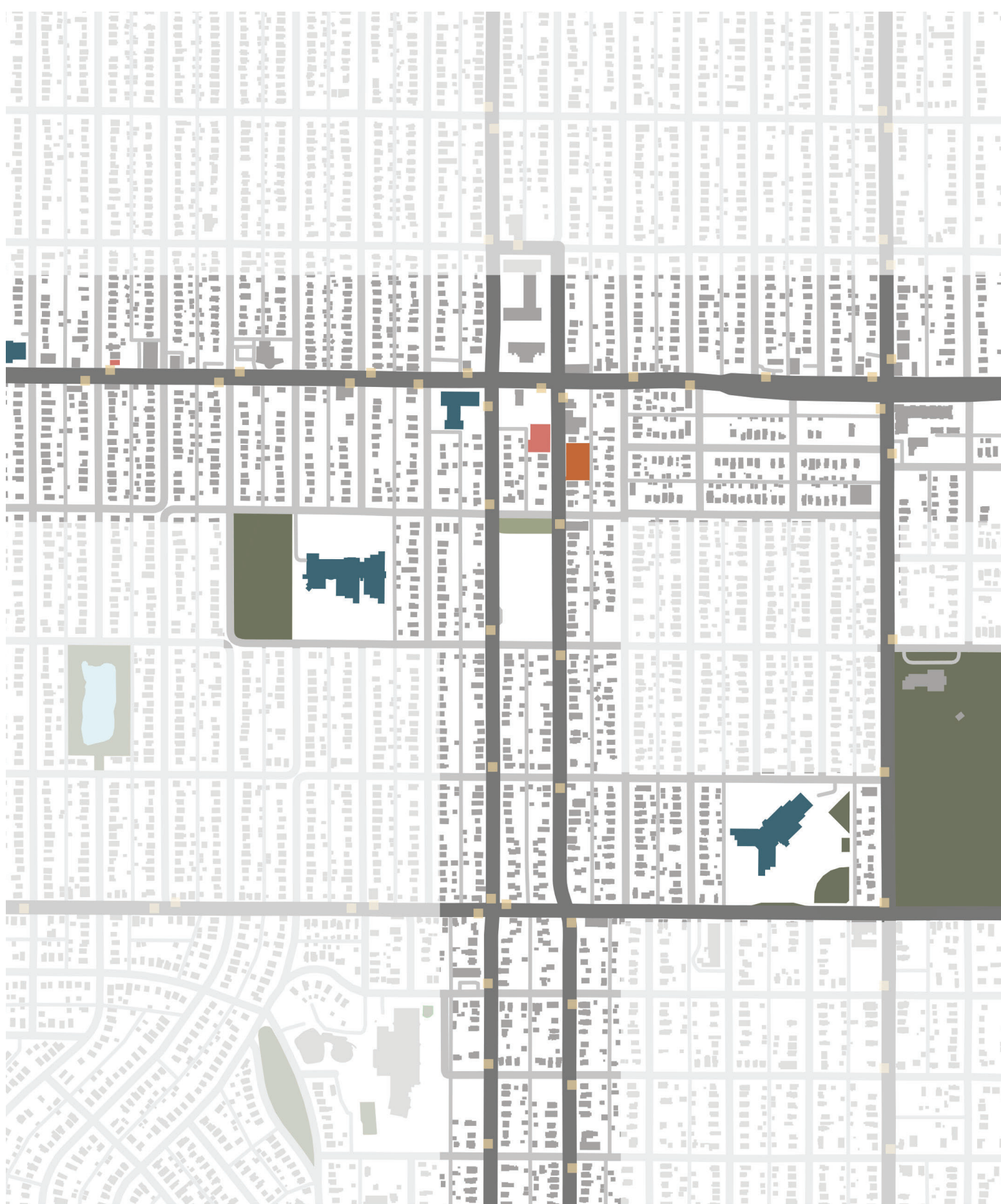
BUILDING SITE + NEIGHBORHOOD CONTEXT

through the integration of solar energy, organics recycling, and food production, thus decreasing the monthly financial burden of home ownership. The interface between communal work space, private studios, and private residences at the heart of the project provides opportunities for collaboration, decreases isolation, and strengthens connections within the community. Finally, we envision a process that is also affordable to develop; the building design and financial model both allow for phasing which will minimize the initial hurdle of development.