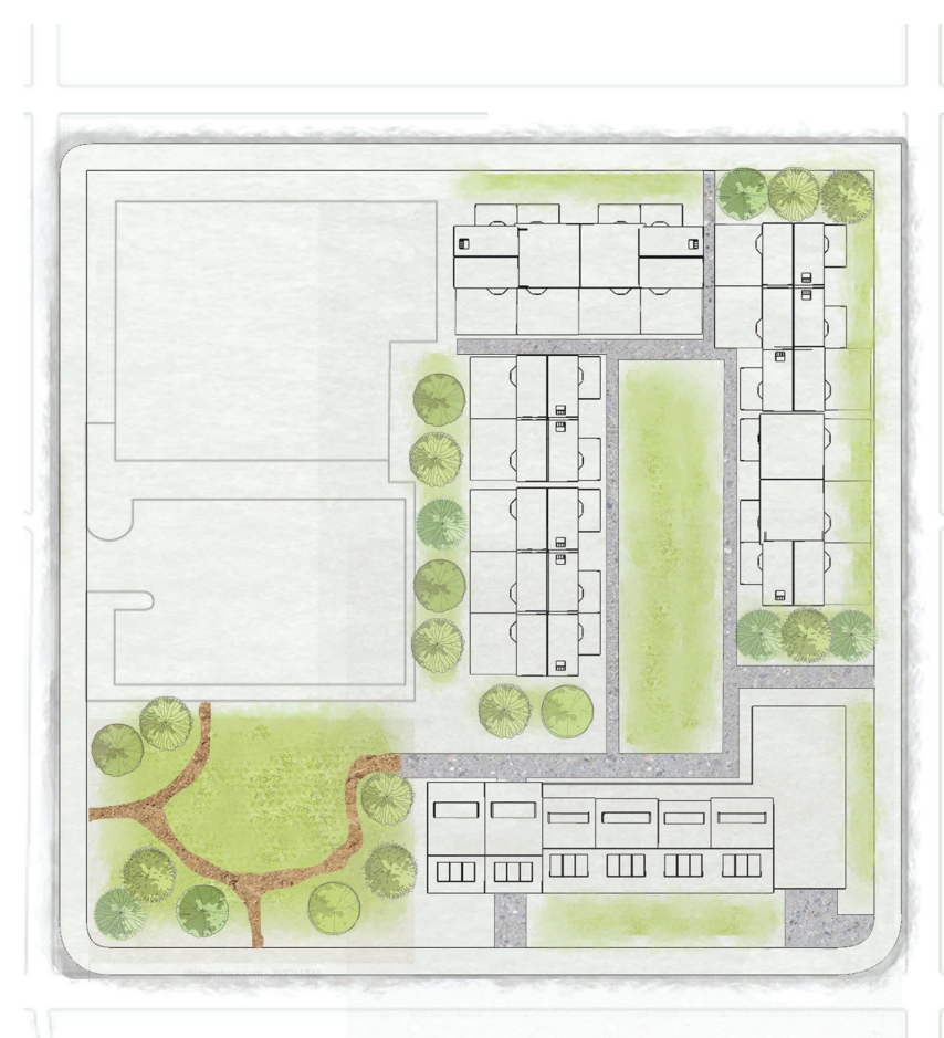
BLOCK SITE PLAN