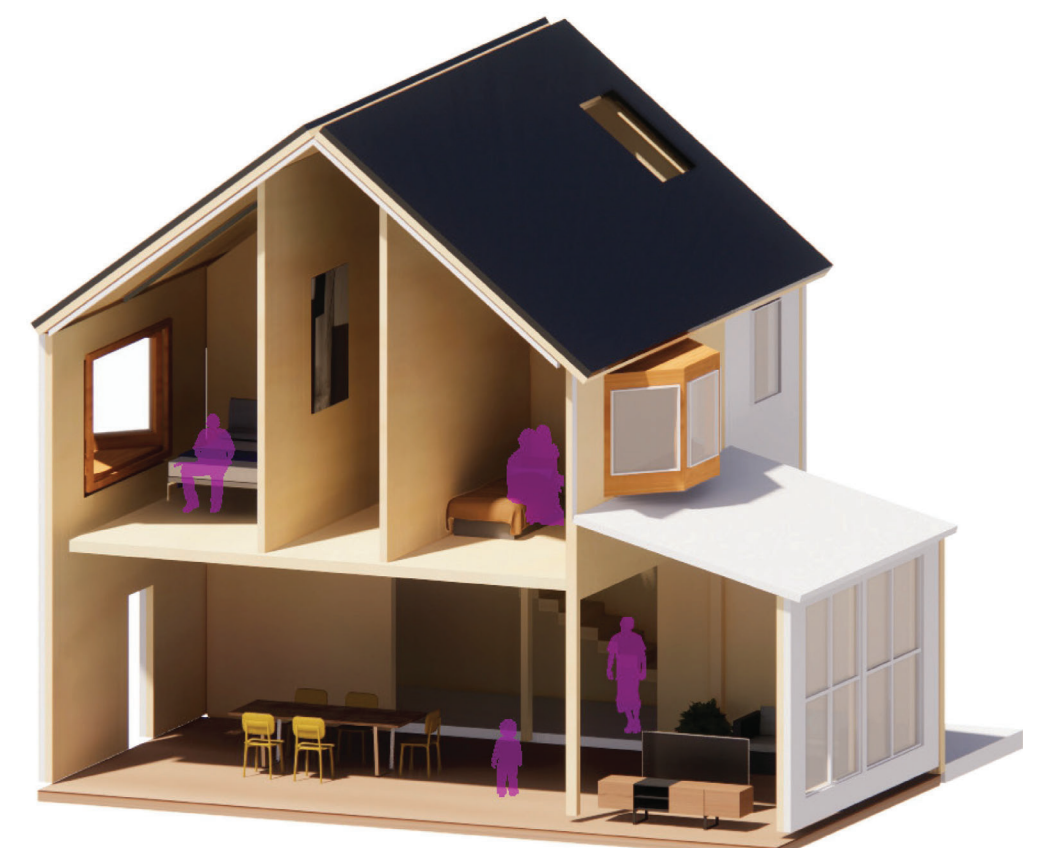
HOUSE CONSTRUCTION DIAGRAM