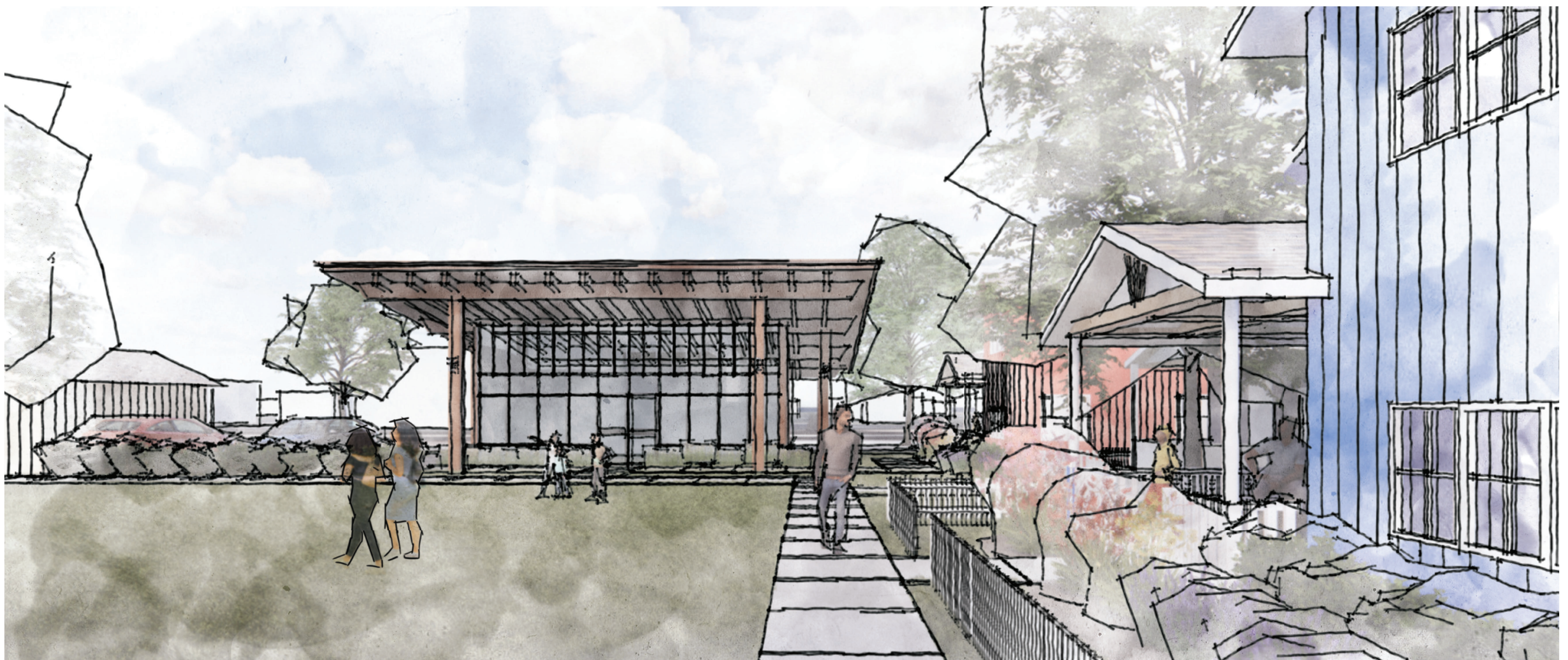
EXTERIOR RENDERING OF SHARED PUBLIC BLOCK COURTYARD SHOWING DIFFERENT HOUSING TYPES

Community, security, and density define this Northside pocket neighborhood. Fostering community by aiding relationship building, front doors of housing face the shared community space. Security is fostered physically by having shared communal spaces looked after jointly by the neighbors, not just one household. Financial security is generated by affordability with small building footprints, shared land holdings in communal land trusts, and more units (increased density). The adjacent Food Co-op provides healthy food within reach of residents' budgets. The project addresses the aims of the Minneapolis 2040 plan for increased density with high quality, affordable residential units in a secure, socially connected neighborhood setting, a lasting, effective solution.